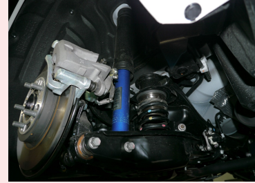
Installed on Lexus CT200h