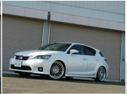
Front: -30mm, Rear: -30mm ride height pictured

The CUSCO "Street ZERO" coilover suspension provides great stability especially targeted for daily driving and high speed cruising. The suspension kit is designed exclusively for vehicles equipped with a large wheel size low profile tires, such as the Lexus CT200h. The stability is still maintained even after the installation of larger aftermarket wheels, reducing the harsh bumpy feeling by utilizing the factory upper strut mounts. The result is a well balanced suspension setup that provides a stylish look for the new Lexus models.