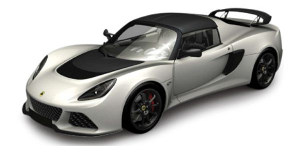
EVORA / EVORA S / EVORA S SR / EVORA 400 * 2GR-FE + 6MT model only

EXIGE S / EXIGE S CR / EXIGE Sport 350 * 2GR-FE + 6MT model only