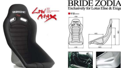
BRIDE ZODIA Exclusively for Lotus Elise & Exige