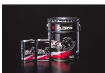
[CUSCO LSD OIL]