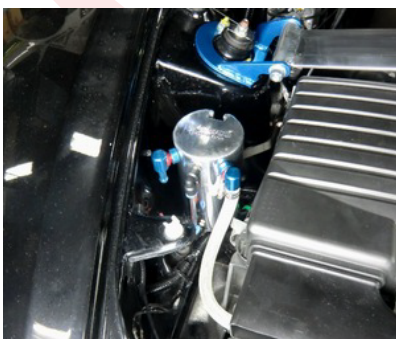
OIL CATCH TANK