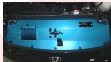
RADIATOR COOLING PLATE