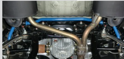
REAR SWAY BAR

PROGRESSIVE EQUIPMENT ® Reduces body flex and adds rigidity. Tested and proven in professional race environments. Recommended for those who desire both high performance driving and daily street use.