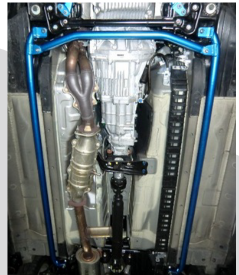
FLOOR REINFORCEMENT BAR