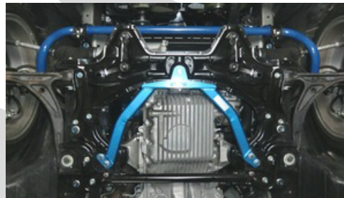
FRONT SWAY & LOWER ARM BAR