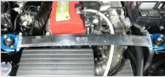
TYPE 3 (FLAT) STRUT BAR NEW FLAT DESIGN!