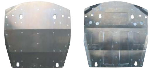
With Rib, Light weight Processing For CT9A Lancer Evolution