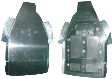
WRC Under Guard Kit For GDB Impreza