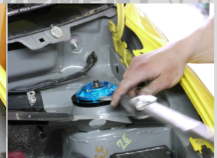
Tighten with included wrench to 90Nm