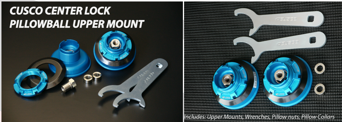
Includes: Upper Mounts, Wrenches, Pillow nuts, Pillow Collars