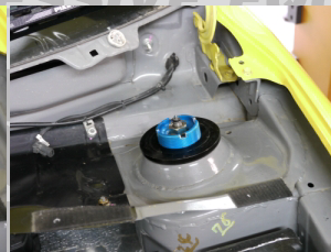
The large washer secures it to the monocone