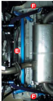
MITSUBISHI LANCER Evolution X (CZ4A)