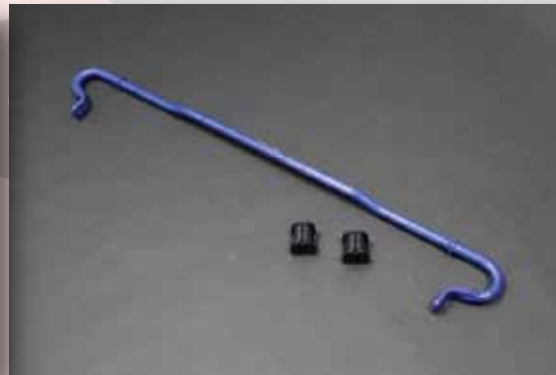
Rear Sway Bar Part #: 692 311 B20, MSRP $280.00