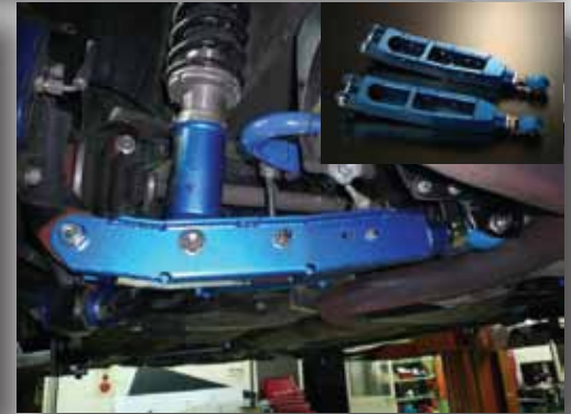
Rear Lateral Link Part: 692 472 L, MSRP $574.00