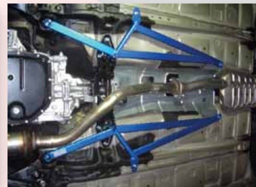
Powerbrace Floor Center Part #: 692 492 C, MSRP $507.00