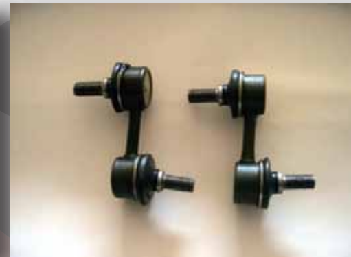
Strengthened End Link Part #: 667 318 A, MSRP $74.00