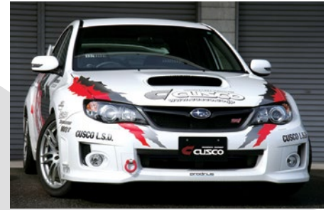
Impreza (GVB) Front Tow Hook