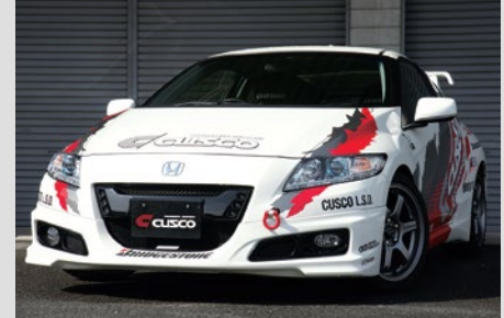
CR-Z (ZF1) Front Tow Hook