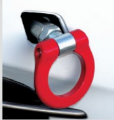
FOLDS TO 90°