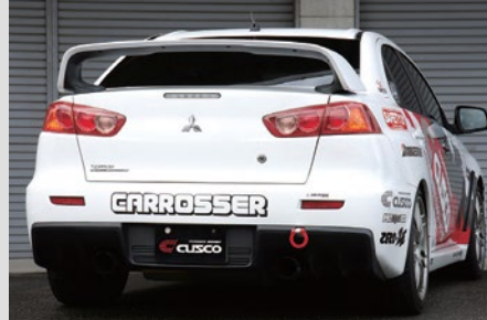
Lancer Evo X (CZ4A) Rear Tow Hook