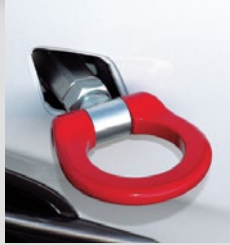
SWIVELS TO 180°