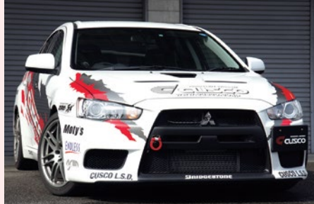
Lancer Evo X (CZ4A) Front Tow Hook